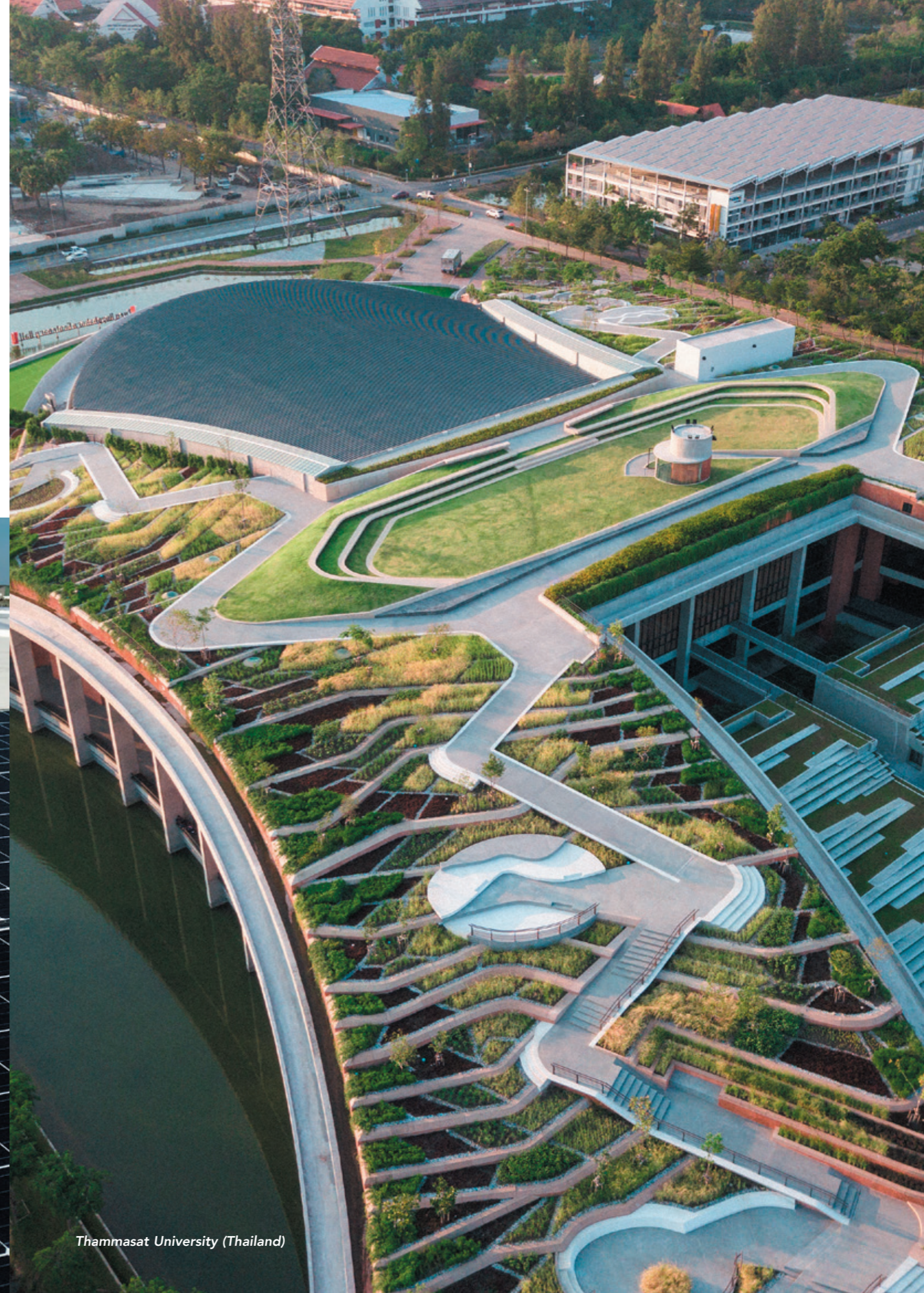
Thammasat University (Thailand)